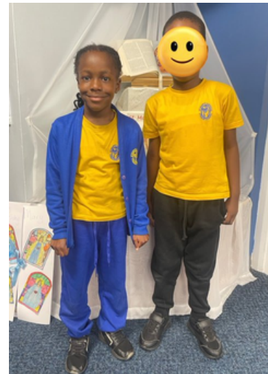
PE uniform – still in school colours