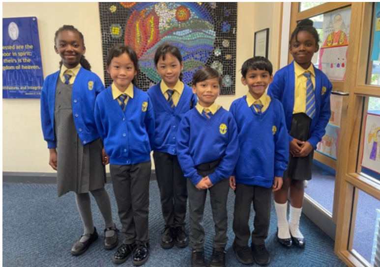
Winter Uniform – includes tie

As the mornings grow chillier and summer begins to feel like a distant memory, we kindly ask that all children now transition into their winter uniform. This includes a gold shirt or blouse, striped tie, royal blue sweatshirt or cardigan, and grey school trousers, skirt, or pinafore. Footwear should be plain black shoes—please note that trainers and boots are not permitted. We are incredibly proud of our school identity, and the winter uniform really helps our children look smart, confident, and ready to learn. If you need any support sourcing uniform items, please don't hesitate to contact the school office—we're here to help. A gentle reminder to ensure all uniform items are clearly labelled with your child's name. With school photos taking place on Thursday 16th October , it's important that all children are in full winter uniform by then. Children continue to wear their PE kits (where plain trainers are allowed) on their PE days.